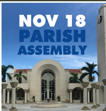
Save the Date! Nov. 18 Parish Assembly PAGE 3