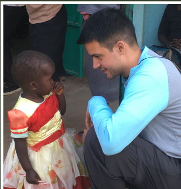
First Fruits: Saint Mark & Kenya Mission PAGE 2