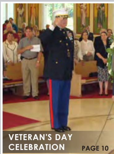
VETERAN'S DAY CELEBRATION PAGE 10