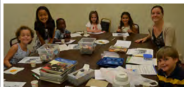
RECAP OF AN EVENTFUL OCTOBER OF CHURCH MINISTRY PAGE 4