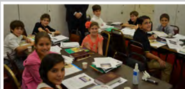
SUNDAY SCHOOL MAKING AN IMPRESSION ON OUR YOUTH PAGE 3