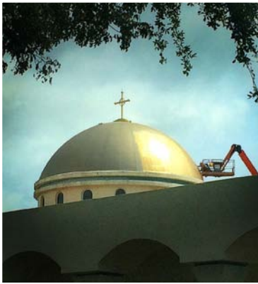
Capital Improvements Underway! PAGE 3