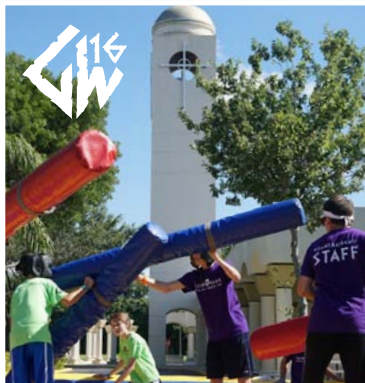
Sign Up for Saint Mark Greek Week '16! PAGE 10