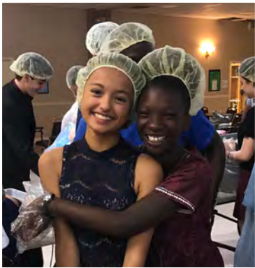
Saint Mark Feeds 20,000 Hungry Children!