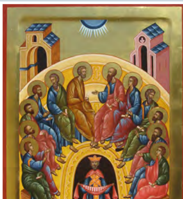
Preparing for the Feast of Pentecost